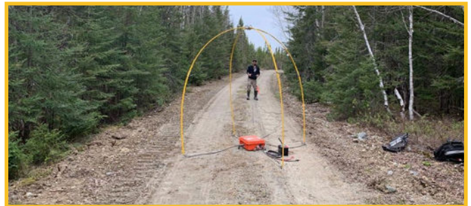
Geological survey - pelican box with receiver and four electrodes.

In addition to drilling, the team also advanced other exploration activities. Geophysical surveys were completed in May, June and July, with the results helping refine drill targets and identify new areas of interest.