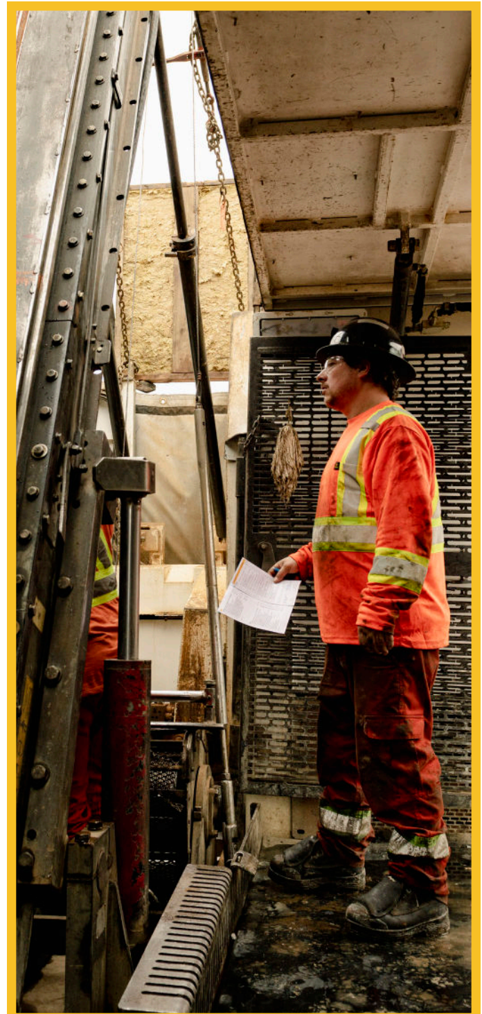
A Gold Candle contractor inspecting one of the drills on site.